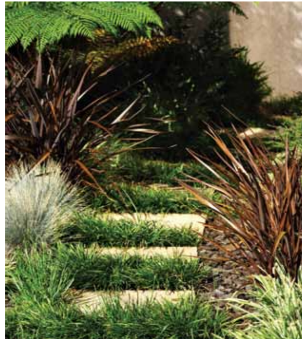
Living Matter Landscape Styling and Design

Your eyes are always drawn to the areas that look out of place. A great tip is to keep the number of different materials to a minimum.