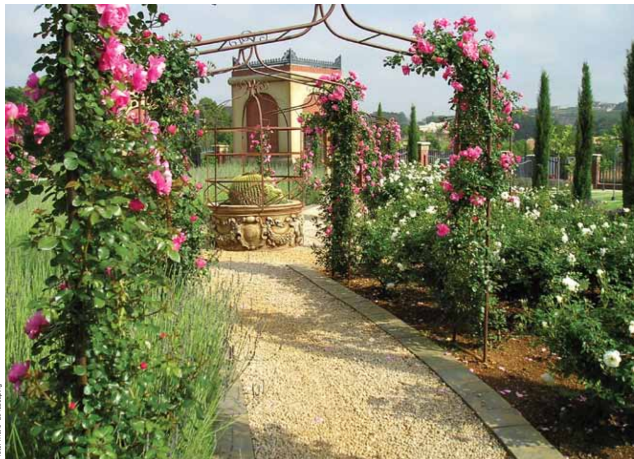
Pieter Muller Landscaping

Your eyes are always drawn to the areas that look out of place. A great tip is to keep the number of different materials to a minimum.